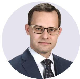
Undersecretary of State Dr. Marcin Romanowski Ministry of Justice (Poland)